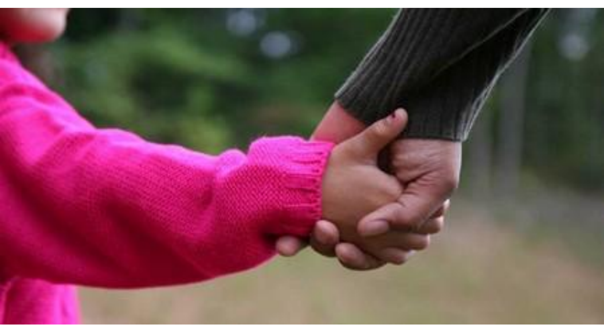
2 Corinthians 6:18